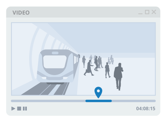
He easily marks this time or time period by creating a bookmark.