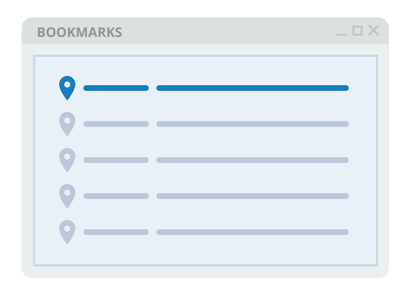
The bookmark is automatically linked with available meta data.