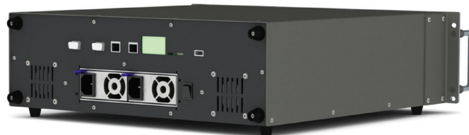
Rear view [above] showing dual Gig-E ports, alarm/relay connections and the dual hot-swap PSU option. Note that the two cooling fans are software controlled and are normally switched off.