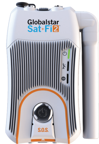
Satellite Wi-Fi Hotspot

Run your business and your life, manage emergencies and stay productive all with the convenience of connecting up to 8 personal smart devices to your own private satellite Wi-Fi network.