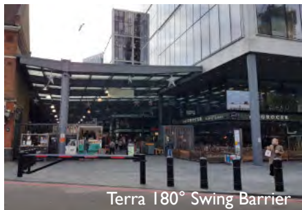
Terra 180° Swing Barrier