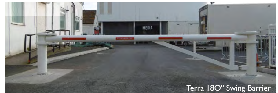
Terra 180° Swing Barrier