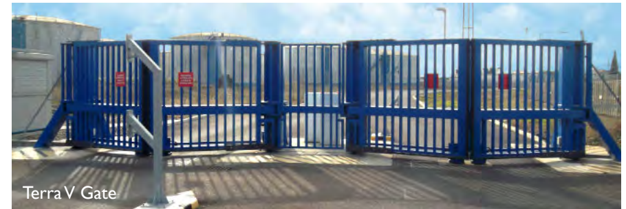
Terra V Gate