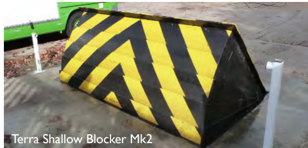
Terra Shallow Blocker Mk2