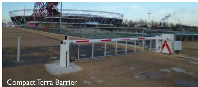
Compact Terra Barrier