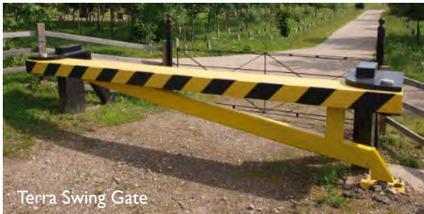
Terra Swing Gate