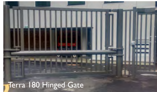
Terra 180 Hinged Gate