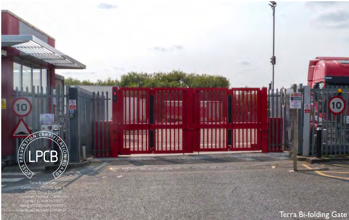
Terra Bi-folding Gate

Terra Bi-folding Gates, Terra Sliding Cantilevered Gates, Terra V Gates, Terra Swing Gates