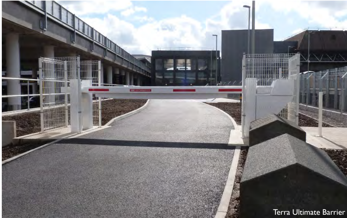
Terra Ultimate Barrier

Compact Terra Barrier, Terra Ultimate Barrier & Terra 180 Swing Barriers