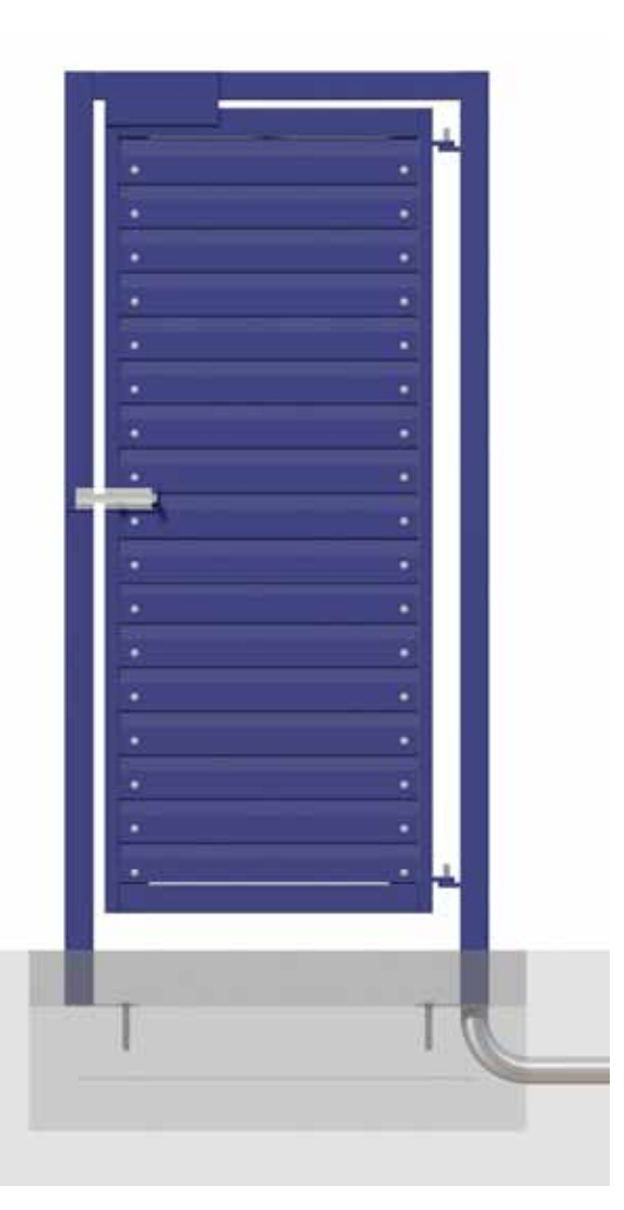
Applications: The popular pedestrian gate that is frequently installed adjacent to turnstiles to provide DDA pedestrian access.