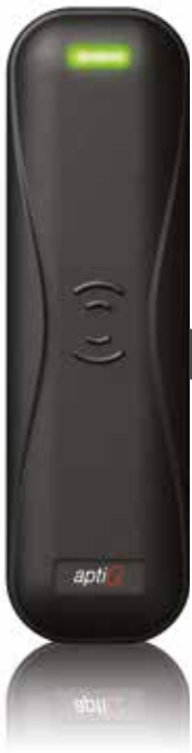
aptiQ™ Multi-Technology Mullion Reader