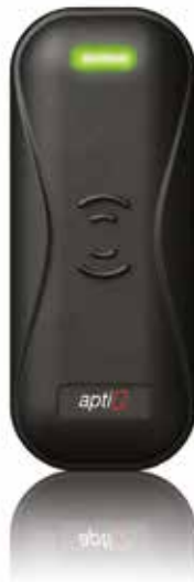
aptiQ™ Smart Mini-Mullion Reader