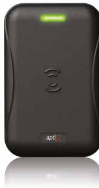
aptiQ™ Multi-Technology Single Gang Reader