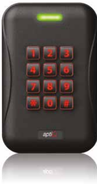
aptiQ™ Multi-Technology Single Gang Reader with Keypad

Our readers use an open architecture design following ISO 14443 standards and Wiegand protocol for interoperability with many popular access control systems.