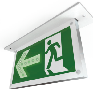
2: ALARM EVENT DYNAMIC SIGN FOR SAFE EXIT