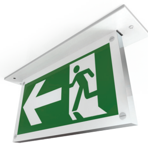
1: ALARM PASSIVE SIGN

Installation is ideal for suspended and tightly attached ceiling structures due to its two rotating fixing arms that secure the housing in place across different thickness supporting surfaces, and two screw fittings for the visible fascia plate.