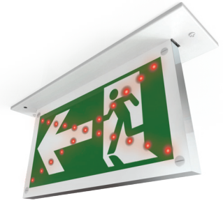
3: ALARM EVENT ADAPTIVE SIGN FOR UNSAFE EXIT

Available in standard white fascia and also in brass or a chrome effect.