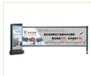
PBG Series Advertising Barrier