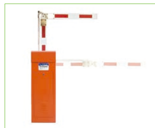
ZK-BAR-A1-90 Automatic Barrier