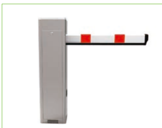
PB Series Automatic Barrier