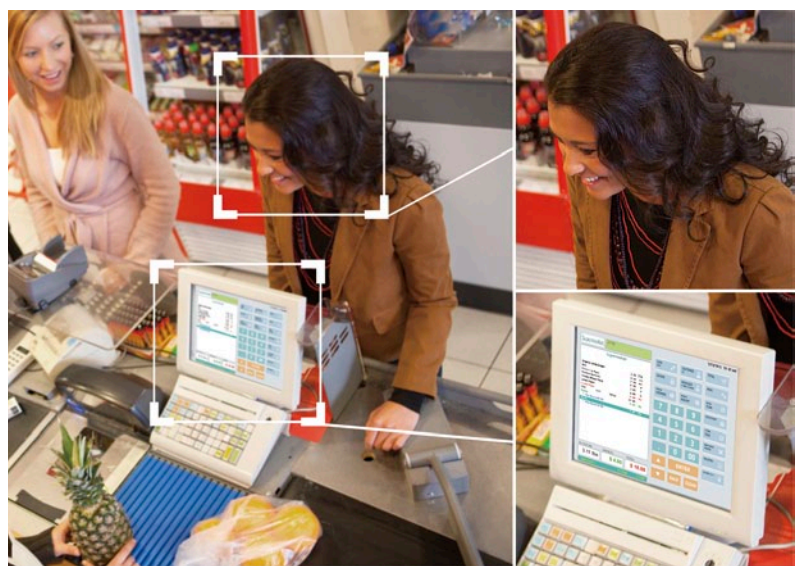
Figure 1. Clear, sharp video helps retailers effectively resolve transaction disputes and better analyze customer behavior.

High resolution like 4K display enables sophisticated solutions for tracking people, capturing facial characteristics, reading license plate numbers, and monitoring large areas such as parking lots with fewer cameras. Although high resolution can deliver a clearer picture and better viewing experience to security, high resolution demands faster transcoding to maintain smooth playback over wired and wireless connections. In particular, video delivery must be tailored to a wide range of devices – from high-powered client workstations to tablet computers and smartphones. In addition, the larger files sizes of 4K