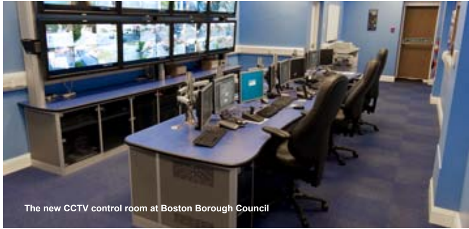
The new CCTV control room at Boston Borough Council